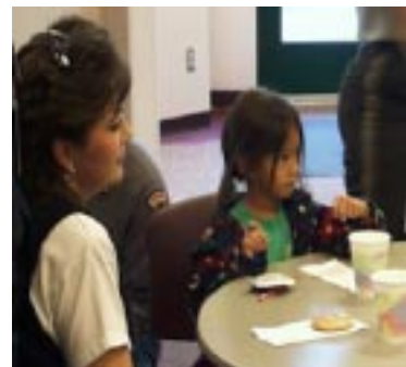
Cops & Kids