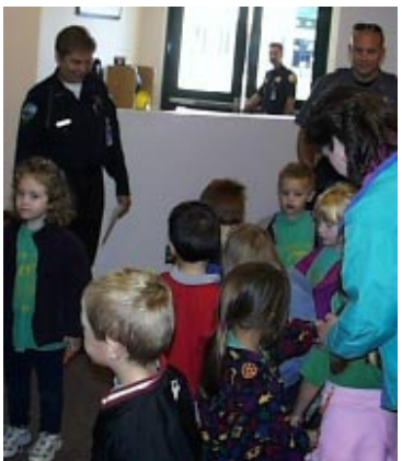
Cops & Kids