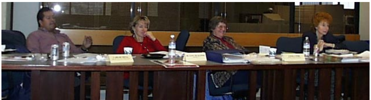
Some Task Force Members