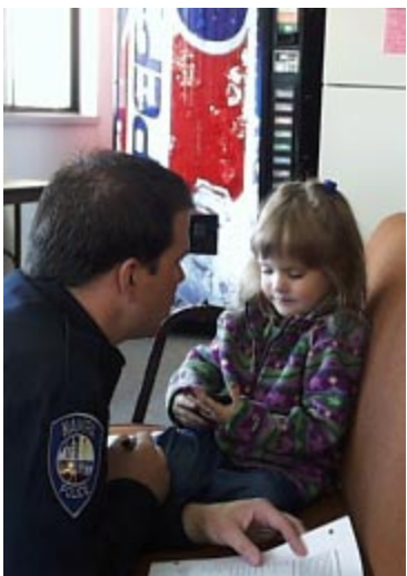
Cops & Kids